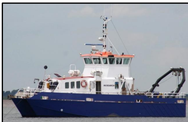
Figure 2: Benthic Surveyor – Environmental Scope Vessel